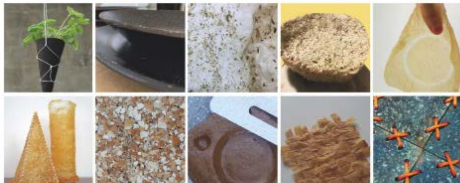
Figure 1 | New materials and products made from food waste by CIG-Lab group within Food-Cycle research.