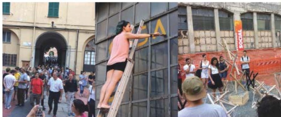
Figure 2 | Workshop activities within the Former Gavoglio barracks during the Rebel Matters Social Barriers III.

the former Gavoglio barracks in a co-design process, the methodology for the ReCITYing project was identified. The reactivation of the spaces was ensured through events that brought citizenship into the abandoned spaces (Fig. 2). The physical construction site became a yard of innovation and creativity, where the use of new technologies, artificial and human intelligence during temporary events represents a research-action programme to promote local co-creation potentials and the development of creative hubs.