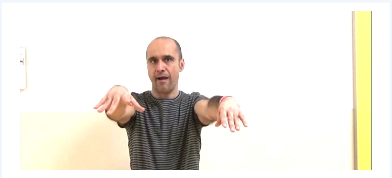
Video 6. Patient F: Segment 1 (before DBS): severe speech-induced oromandibular dystonia, right upper limb jerky dystonia and writer's cramp; mild right torticollis; segment 2 (4 years after pallidal DBS): persistence of mild right torticollis, right upper limb dystonic tremor; improvement of oromandibular dystonia. Video content can be viewed at https://onlinelibrary.wiley.com/doi/10.1002/mdc3.13927

Patient E is 33-year-old woman without family history of neurological disorders and normal development. She presented at the age of 12 with dystonic dysarthria, dysphonia, oromandibular and tongue dystonia. She progressively developed dystonia of right upper limb with myoclonic jerks, orthostatic axial jerks, lower limb dystonia with superimposed dystonic tremor, and