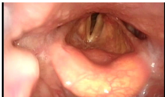
Video 2. Patient B.II.6: The patient underwent flexible videolaryngoscopy by a 4 mm endoscope introduced through a nasal fossa. While he was spontaneously breathing dramatic constrictive spasms involving the oropharynx and the hypopharynx were observed, which sub-completely obstructed the airway and sporadically impeded the vision of the larynx. During endoscopic observation he was asked to answer questions, repeat numbers, and phonate a sustained /i/: his vocal cords were moving normally during these tasks and, while he was phonating a significant reduction of the constricting pharyngeal spasms was seen. At the end of phonation, a severe recurrence of pharyngeal constricting spasms can be seen, causing respiratory distress. Video content can be viewed at https://onlinelibrary.wiley.com/doi/10.1002/mdc3.13927

The proband's mother (C.I.2) presented at the age of 40 with axial and right upper limb dystonia. In the following years dystonia spread to the cervical region (retrocollis) associated with dysphonia and dysphagia. In the seventh decade, she progressively developed gait impairment, lower limb hypokinesia, postural instability, falls and slowness of hand movements. These signs responded poorly to levodopa. She underwent GPI-DBS at