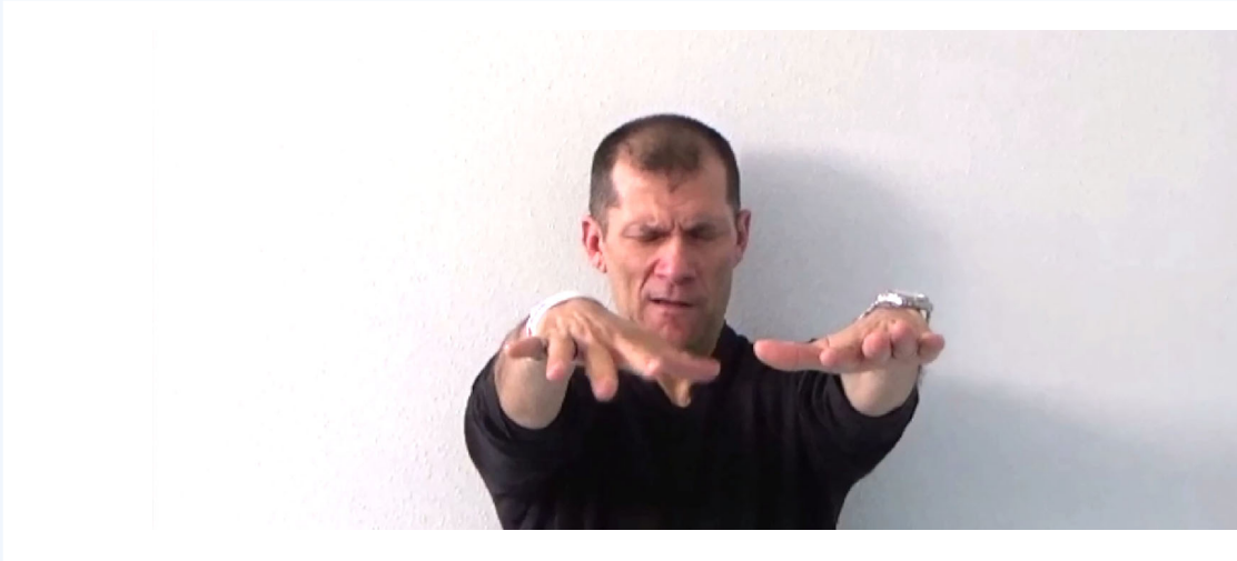
Video 3. Patient C.II.1: Segment 1 (before DBS): generalized tremulous dystonia with jerky features affecting more prominently the neck (left torticollis), right upper limb and left lower limb (striatal toe); voice tremor; writer's cramp with writing tremor; segment 2 and 3 (4 and 10 years after pallidal DBS): improvement of cervical dystonia and lower limb dystonia; persistence of dystonic head and upper limb tremor, dystonic posturing of the left upper limb when outstretched and writer's cramp/writing tremor. Video content can be viewed at https://onlinelibrary.wiley.com/doi/10.1002/mdc3.13927