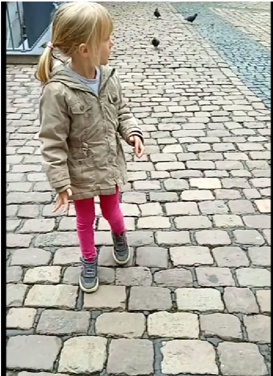
Video 4. Patient D.II.1: tic-like movements, hand stereotypies and choreic movements of both hands. Video content can be viewed at https://onlinelibrary.wiley.com/doi/10.1002/mdc3.13927

68 years of age with improvement of retrocollis. She died at 79 years of age from aspiration pneumonia. The proband's sister (C.II.2) was affected by dysphonia, dystonic dysarthria and writer's cramp with onset during adolescence and progressive spreading with predominant cranio-cervical and upper limbs involvement. A brief trial with levodopa up to 200 mg proved to be ineffective on these symptoms. She underwent GPI-DBS with great benefit (Fig. 1).